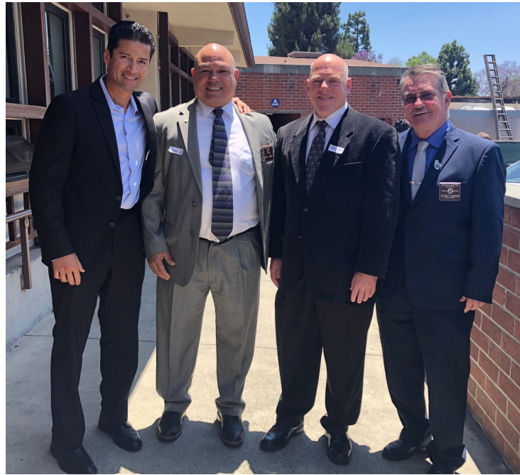
St. Anthony Feast Day Representation